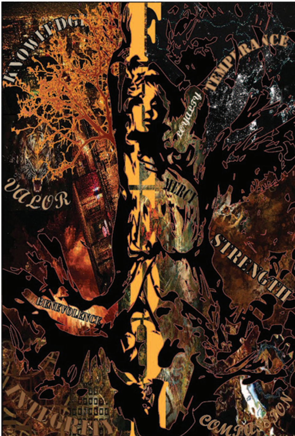
"Virtue" by Brigitte Chum